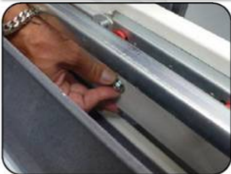
...mit Mutter/ Unterlegscheibe fixieren... Glas Top mit zweiter Person auflegen... ...ausrichten und positionieren...