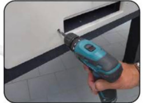
Eventuell etwas nachbohren...