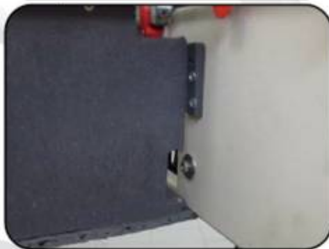
...von hinten mit Mutter/ Unterlegscheibe fixieren...Mittelloch bohren und Schraube...