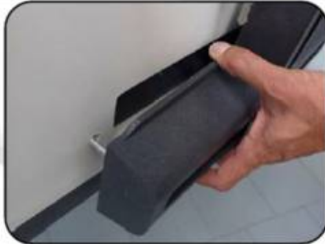
Vormontiertes „T-Stück“ platzieren...