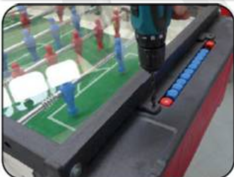
...4 Löcher bohren...Schrauben mit Unterlegscheiben/ Muttern fixieren.